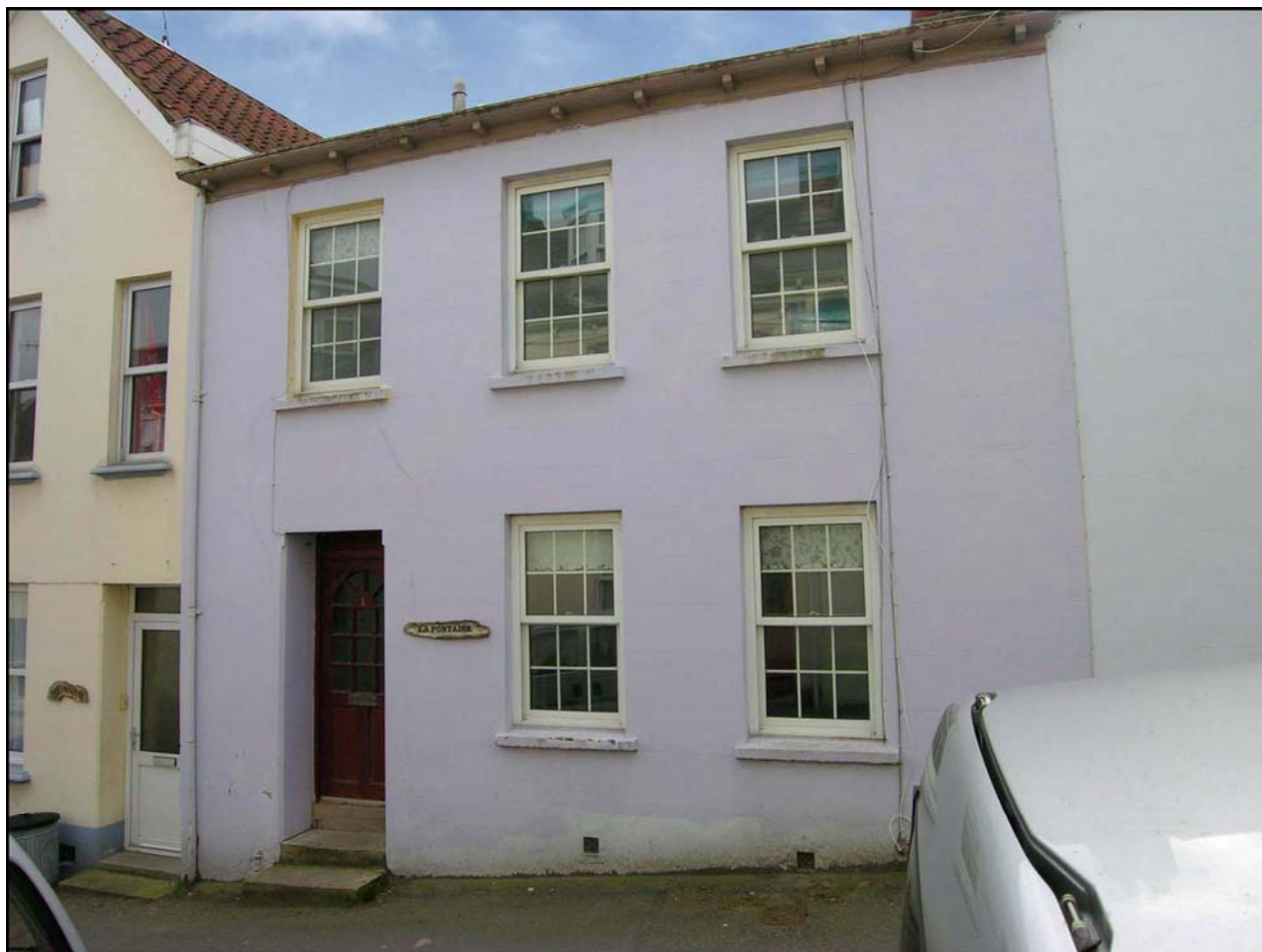
La Pontaise, Valnord Hill, St Peter Port